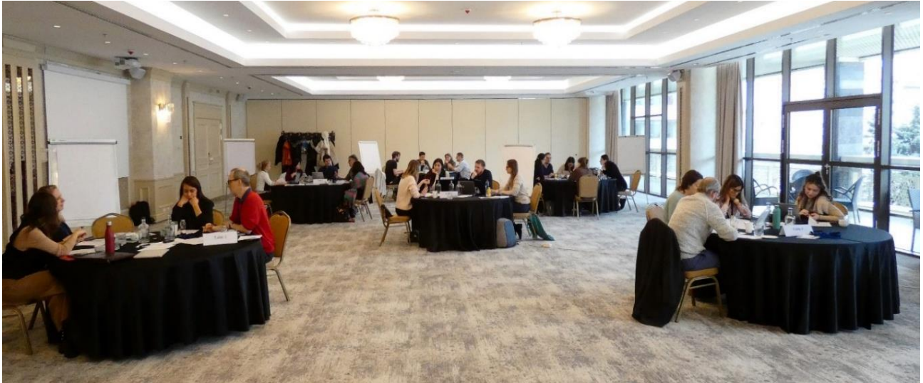
Figure 4: Scenario-building workshop in Sofia

The objective of the third session was to develop concrete recommendations that could facilitate the implementation of measures that stimulate, enhance, strengthen and – if necessary – transform the energy citizenship at the EU, national and local level.