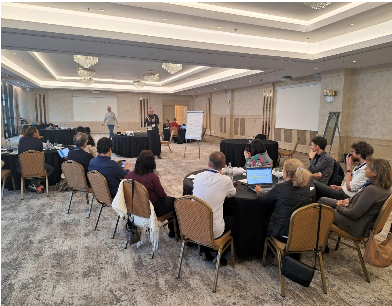
Figure 3: Scenario-building workshop in Sofia

The working group discussions in the first two sessions had the following main objectives: