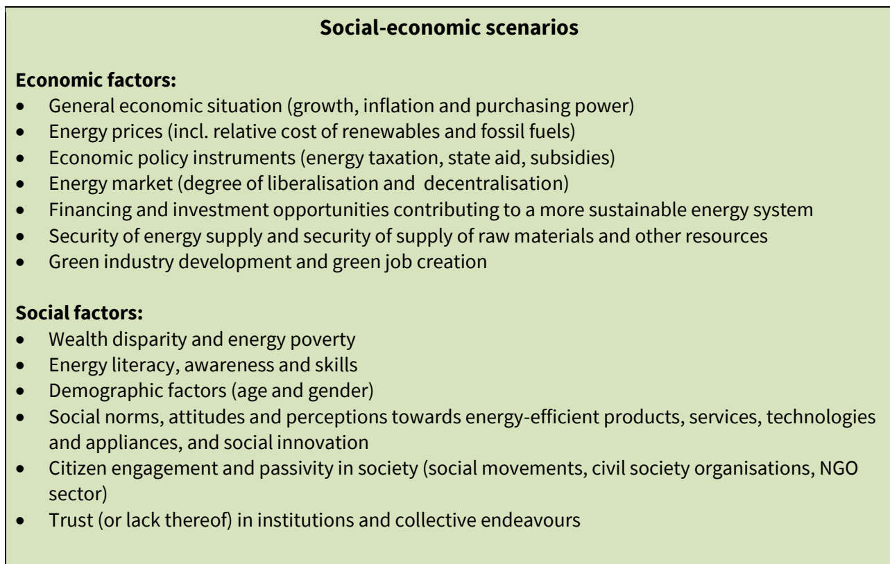
Figure 2: From PESTEL factors to scenario outlines

Using the PESTEL analysis to identify and describe the external factors, which are either conducive or unfavourable to energy citizenship manifestations, enabled us to acquire a comprehensive and realistic overview of the energy citizenship situation in the nine investigated countries and in the EU. The figure below lists the PESTEL factors used to develop scenario outlines.